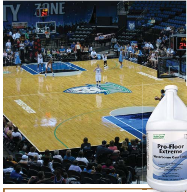
2011 WNBA Champions - Minnesota Lynx. Target Center floor coated with Pro-Floor Extreme April 2010.

NOTE: Some parquet floors should not be finished with polyurethane coatings. Check with floor manufacturer before using on parquet floors.