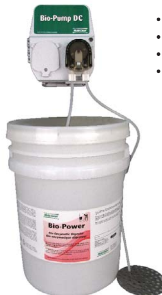
Suggested configuration shown