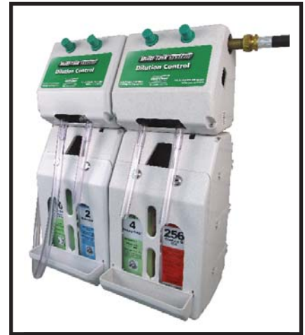
Two Multi-Task units can easily be connected to form a four button unit with no additional parts needed.