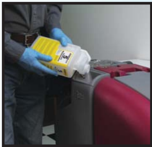
Squeeze N Pour