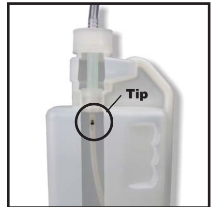
Metering tips are integrated into the container for trouble-free operation.