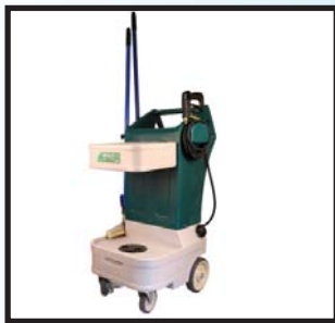
The Wave II