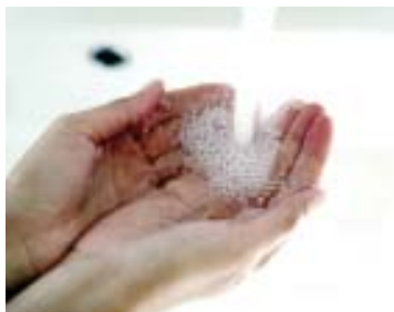
Foaming Dispenser Smoke, part number 421915

Air-infusing system dispenses 0.7-mL of thick, rich foamy soap per pump. Refillable 1200mL (40.5oz) bulk fill tank included with each dispenser.