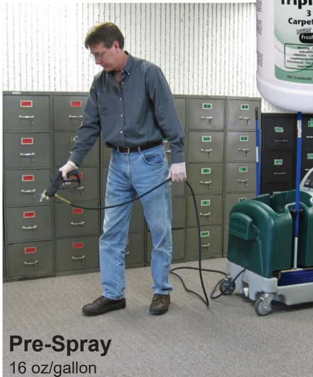
Pre-Spray 16 oz/gallon