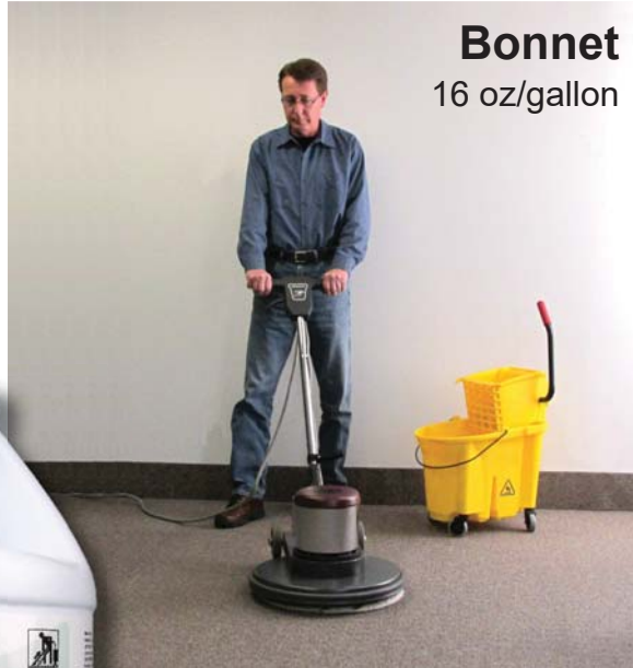
Bonnet 16 oz/gallon