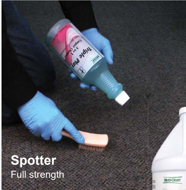
Spotter Full strength