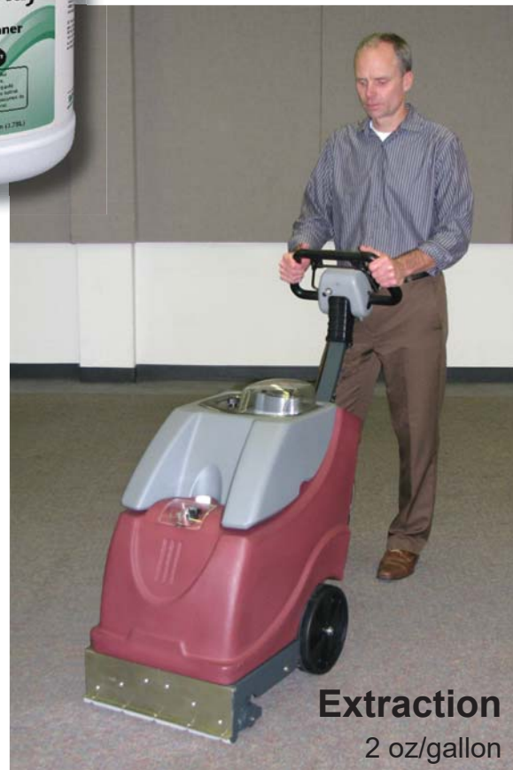
Extraction 2 oz/gallon