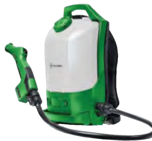
Fill the 2.25 gallon tank with ready to use solution.