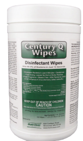
Century Q Wipes