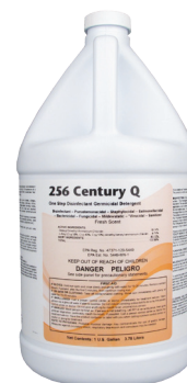
256 Century Q