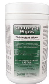
Century Q Wipes