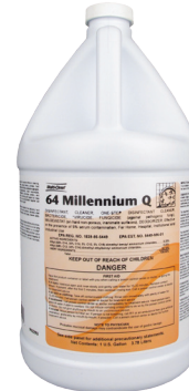
64 Millennium Q