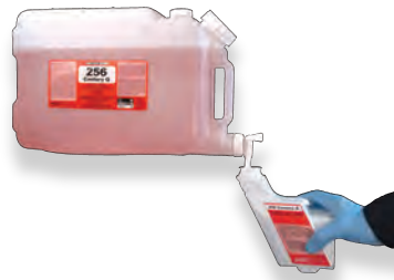
Fill the 33 ounce tank with ready to use solution.