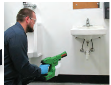
Spray areas using an S shape pattern.