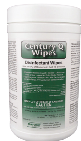
Century Q Wipes