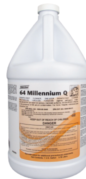
64 Millennium Q