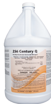
256 Century Q