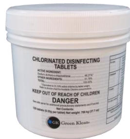
Chlorinated Disinfecting Tablets