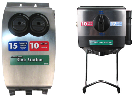
Sink Station for three basin sink cleaning of pots and pans. Sanitation Station for meatroom operations.

Approved for use in meat and poultry plants as a no rinse sanitizer on all surfaces (USDA code D2).