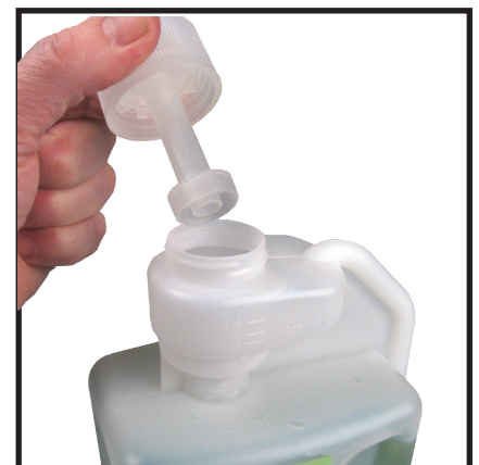
Proprietary cap design activates the Multi-Task system.