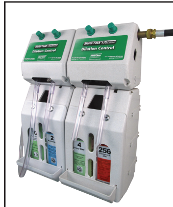
Connect two units together to create a secure 4 product dispenser. Item 421700