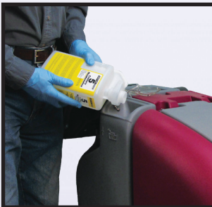
Squeeze N Pour