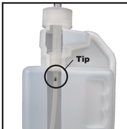
Metering tips are integrated into each container for trouble-free operation.